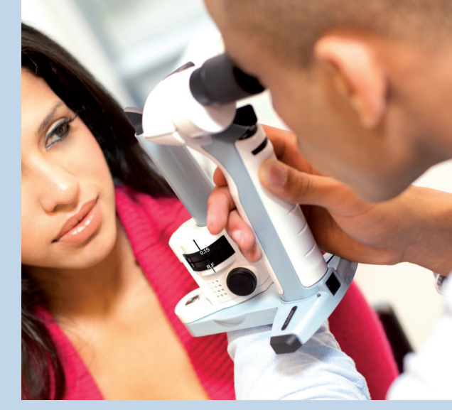
Versatility and portability are key benefits of the Keeler PSL Slit Lamps

Classification: CE Regulation 93/42 EEC: Class I FDA: Class II Production processes, testing, start-up, maintenance, and repairs are conducted in strict conformity with the applicable laws and international reference standards.