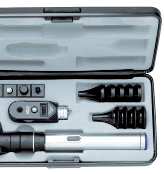
Pocket Diagnostic Set